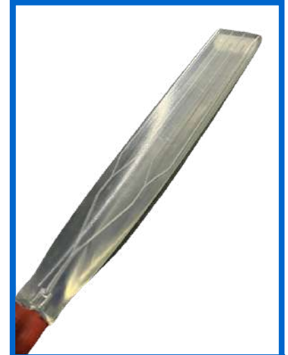
Fuel Tech's channel injectors minimize in basin equipment.

On-Demand Carbonic Acid Generation represents a transformative shift in industrial pre-treatment processes. By adopting this solution, industries can achieve better economic outcomes, enhance safety, and contribute to environmental goals.