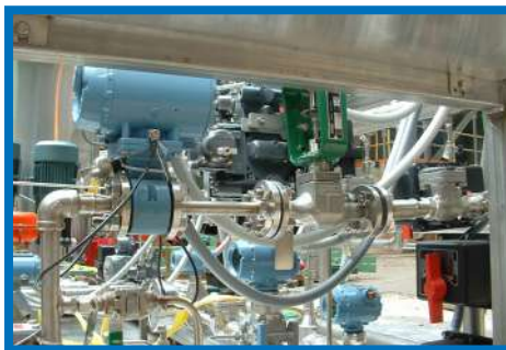
Independent Zone Metering Module

Chemical injectors developed by Fuel Tech facilitate the reagent distribution. The NO x OUT ® injection system utilizes air-atomized injectors which direct the urea solution into the combustion gas path. The droplet size distribution and spray coverage promote efficient contact between the chemical and the NO x in the flue gas.